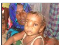
Patient with Meningoencephalocele

Free medicines were distributed and immunization of children done for Paediatric patients. All The patients registered in the camp, were assured 10% discount for further treatment in future if they come to the Polyclinic.