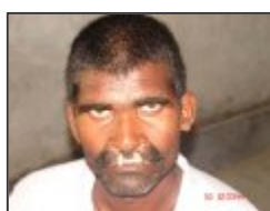
Patient with Cleft Lip

Rural Health Programme (RHP) – VPC team comprising two general physicians, one Ophthalmologist, one Gynaecologist, one Dental Surgeon, one Ayurvedacharya, one DNB trainee and paramedical staff with equipment and machines continued their programmed visits to HARPAN ATARIA on Wednesdays and Saturdays, MEHAORA on Mondays FN and KATRA BAKKAS on Mondays AN in Lucknow District and RAMVANKUTIR on Thursdays in Barabanki District and saw patients as below: